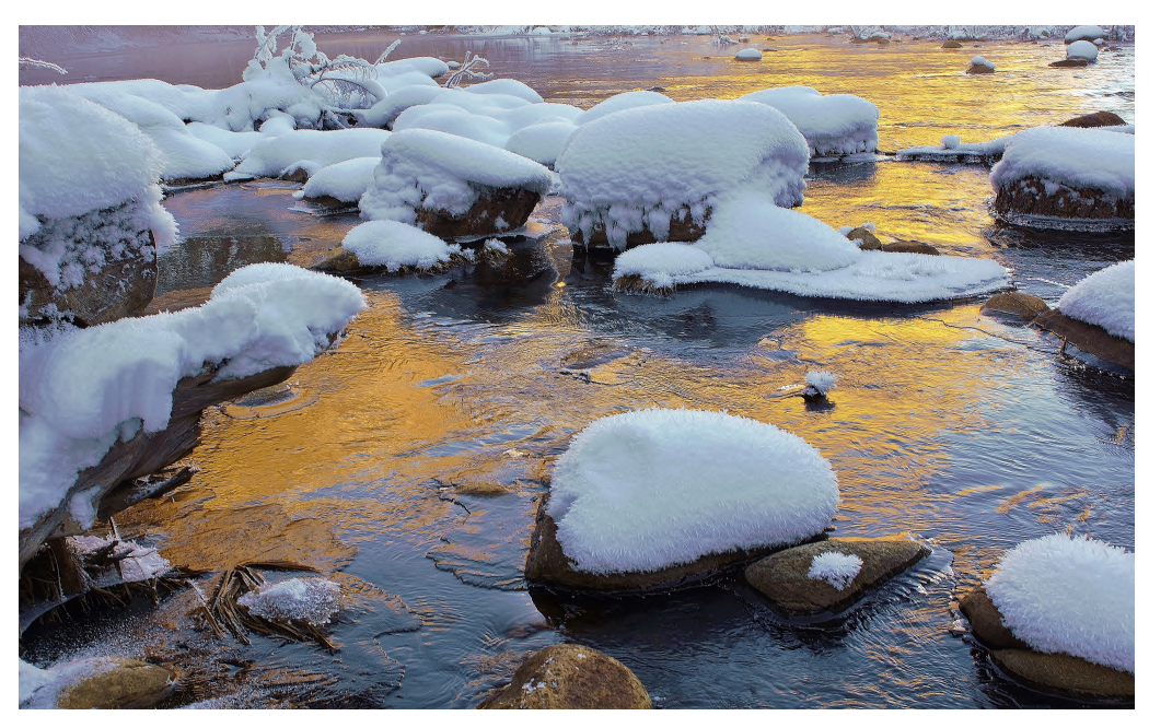
Image: Snow Pillows (Yosemite NP) Detailed info on page 9